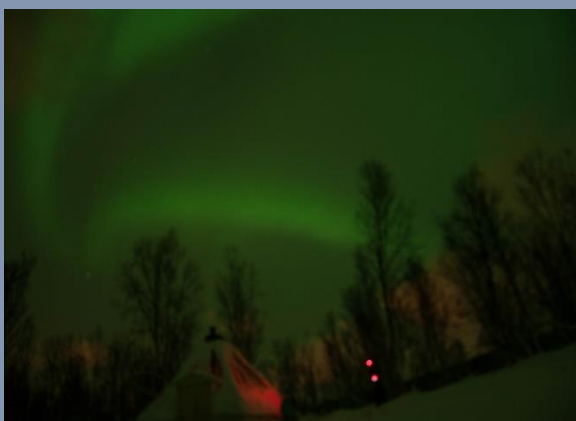
Northern Light in Tromsø

Rarely had I had the chance to travel to a country with an astounding freezing and snowy weather before, so I decided to visit various cities in Norway with my family. We went to the picturesque Ålesund, the famous Bergen and the legendary Tromsø in pursuit of the beauty of the local culture, the stunning sceneries of fjords along the route of 'Norway in a Nutshell' and last but not least, the unforgettable Northern Light. I was lucky enough to be able to see the Northern Light there after series of rainstorms and snowstorms. Watching the green light moving mysteriously in the sky was a mesmerizing moment and was a memory that I will forever remember.