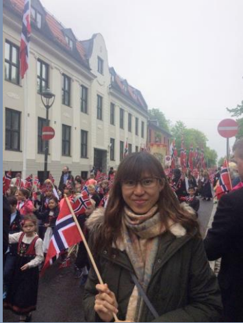
National Day, Oslo

This was a month full of exams, so I spent most of my time on studying and explored more about Oslo. I also celebrated the Norwegian National Day on 17 May by watching the children parade. After the exams, I was busy with the cleaning of my room, packing my luggage and spending my last moments enjoying the city. I left Oslo on 5 June and this officially marked the end of my exchange journey.