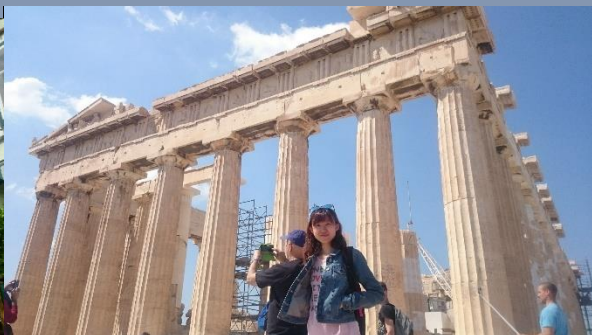
Ancient Greek Ruins, Athens (Greece)