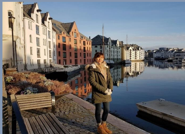
River in Ålesund