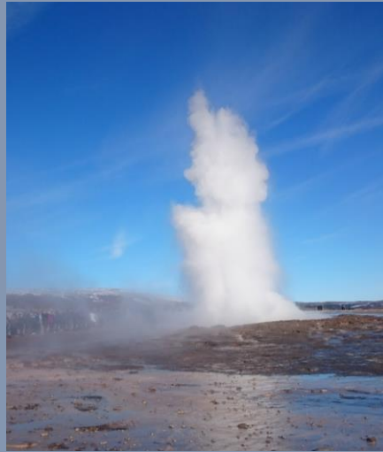
A geyser in Iceland