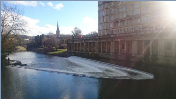
Pulteney Bridge, Bath

My 5-months exchange journey officially started on the day departing from Hong Kong with 5 other UST students to Oslo. With much anticipation and excitement, we finally arrived at Oslo. We quickly checked ourselves in our student accommodations so that we could be settled down and taken a good rest after the super long flight. During the month, we spent most of time exploring and familiarizing with the city, the people and of course, the remarkably cold weather. With the snowy weather, we surely would not miss our chance to be a child again and had some playtime with the snow. Though school had started, most of the courses were still in the introductory stage, so I grabbed some time to travel around in the UK and visit my friend there. We went to some iconic cities, like London, Bath, Oxford, etc., immersed myself into the fascinating British culture and celebrated my first-ever Chinese New Year abroad in London, which was full of festive atmosphere in the China town, to be honest.