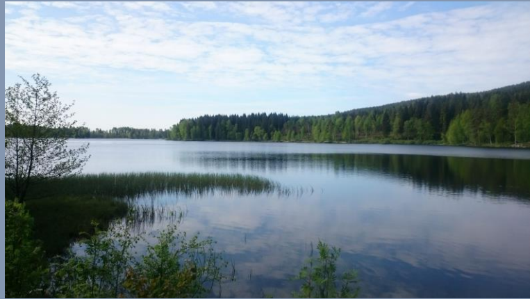
Sognsvann Lake, Oslo (Next to Kringsja)